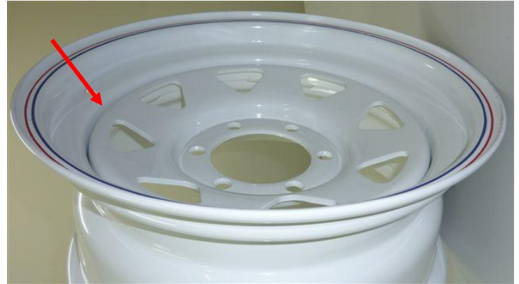
Fig 3 - Centre Disc Not Protruding

If the centre disc is protruding (Fig 2 above) then these wheels must be checked for specific stamping - as follows