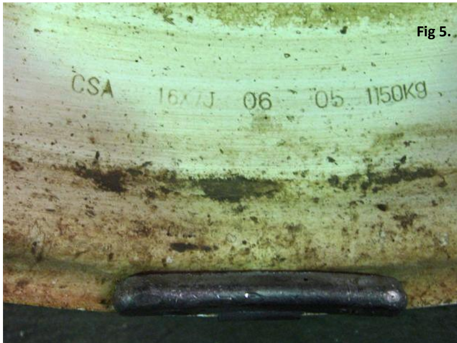
"CSA 16x7J 'YY MM' 1150KG". (The date code applicable is between 06 04 and 08 11 – April 2006 to Nov 2008)

IMPORTANT: Wheels in this recall with stamping (refer Fig 5 above) must also have "P30" stamped on the inside between the stud holes - see Fig 6