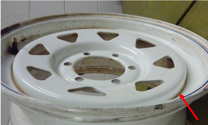
Fig 2 - Protruding Centre Disc

All wheels concerned have the centre disc protruding significantly beyond the well of the rim - see Fig 2. Note: Wheels with non protruding centre disc are NOT included in this recall - see Fig 3